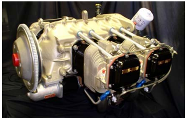
Standard appearance package TMX O-320.

Our reputation for unprecedented quality, service and dedication to our customers needs, speaks for itself.