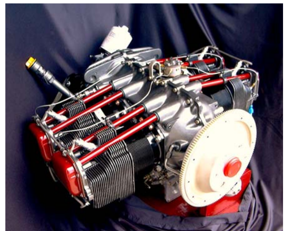
TMX IO-360 with customized appearance package and forward facing cold air induction.

Comprehensive 3 year warranty, personalized service and technical assistance backed by Mattituck's 50 year reputation for quality and service.